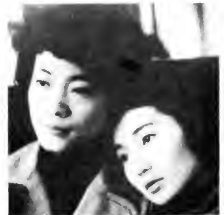
Ann Hui's Song of the Exile